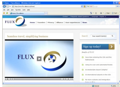
FLUX Webportal & Services